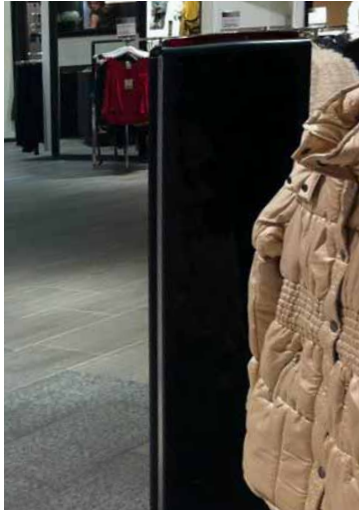
Premium antenna combined with AD Holder. Emotion Järvenpää, Finland